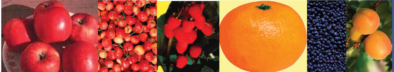
MEMBRANE CONCENTRATION OF JUICE