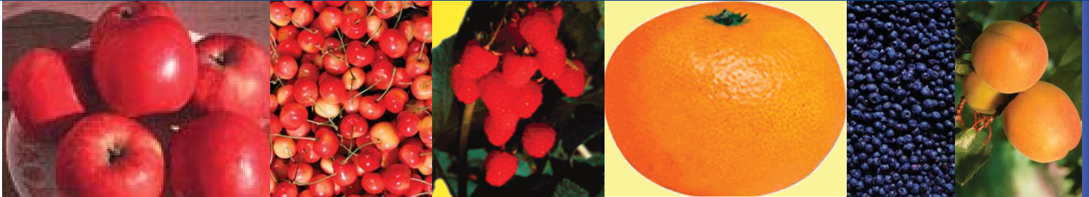
MEMBRANE CLARIFICATION OF JUICE